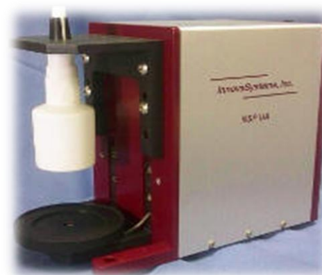
NSP UA - Actuation Station