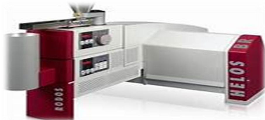
R&D Facility-Sympatec. system for droplet size distribution-r-61000- helios